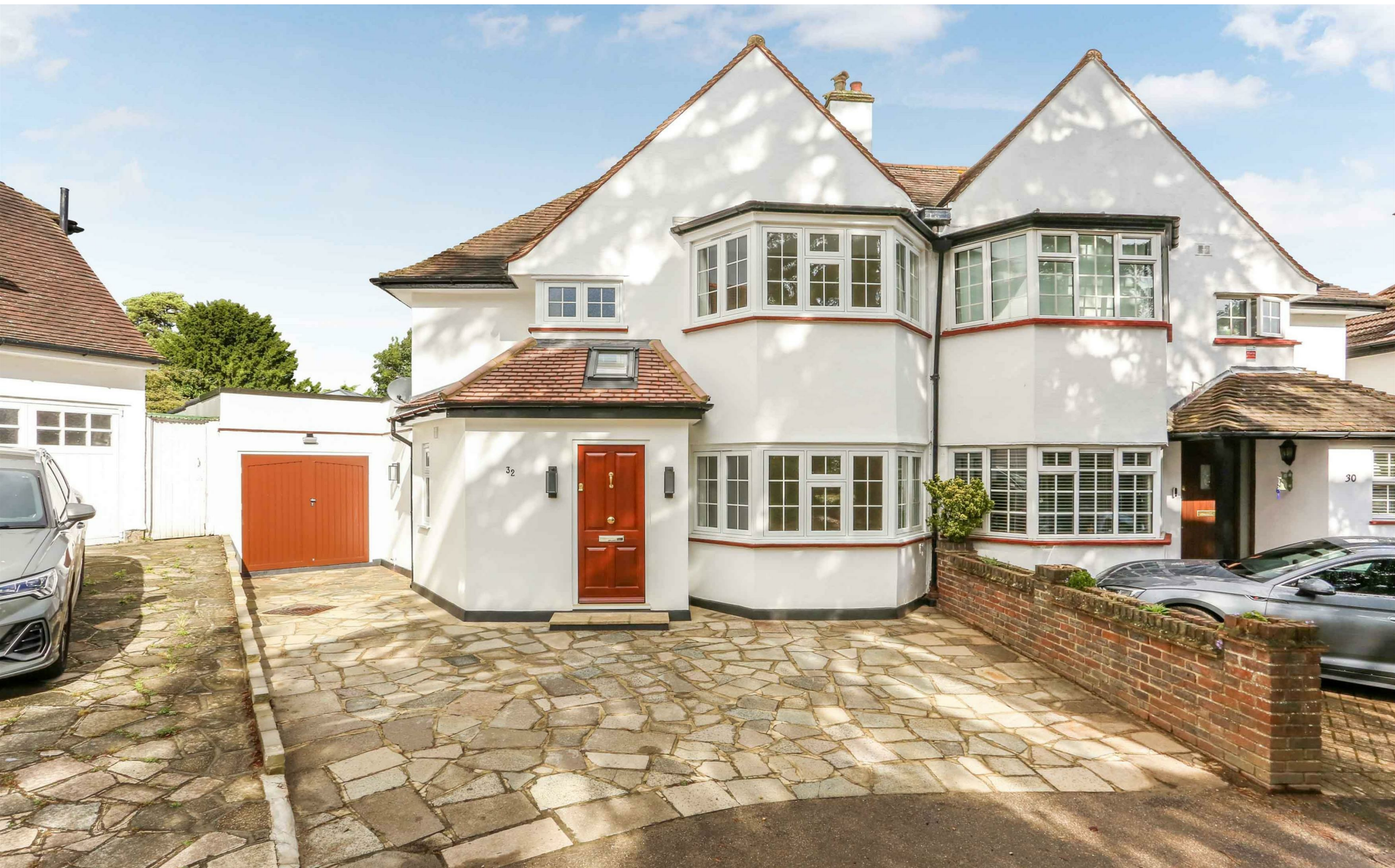
THE GALLOR, SM2

TOTAL APPROX FLOOR PLAN AREA INCLUDING GARAGE 1629 SQ.FT (151 SQ.M) TOTAL APPROX FLOOR PLAN AREA EXCLUDING GARAGE 1588 SQ.FT (147 SQ.M)